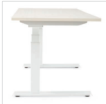
C-foot (recommended for 90° configurations)