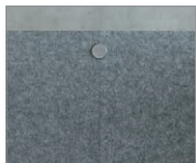
PET Felt divider with connector