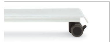
Dual wheel casters