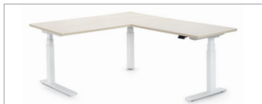
Add a return and third leg kit to create an L workstation.