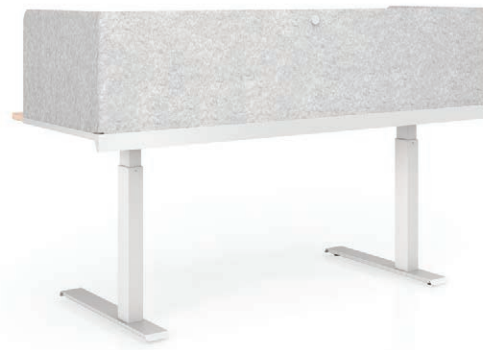
PET Felt wrap around divider provides privacy for more concentrated work.