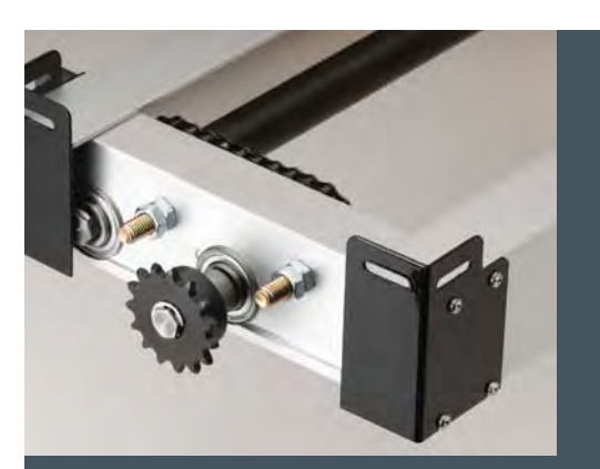
ALUMINUM CARRIAGES SUPPORT UP TO 1,000 LBS. PER LINEAR FOOT.