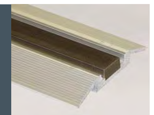
ADA COMPLIANT, HEAVY-DUTY ALUMINUM TRACK WITH ANTI-TIP FEATURE FOR SAFETY. NO GROUTING REQUIRED.