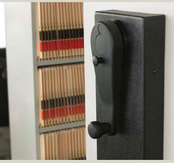
WAIST HIGH HANDLE INCLUDES RANGE LOCK. SECURITY HANDLE WITH KEY LOCK. (OPTIONAL)