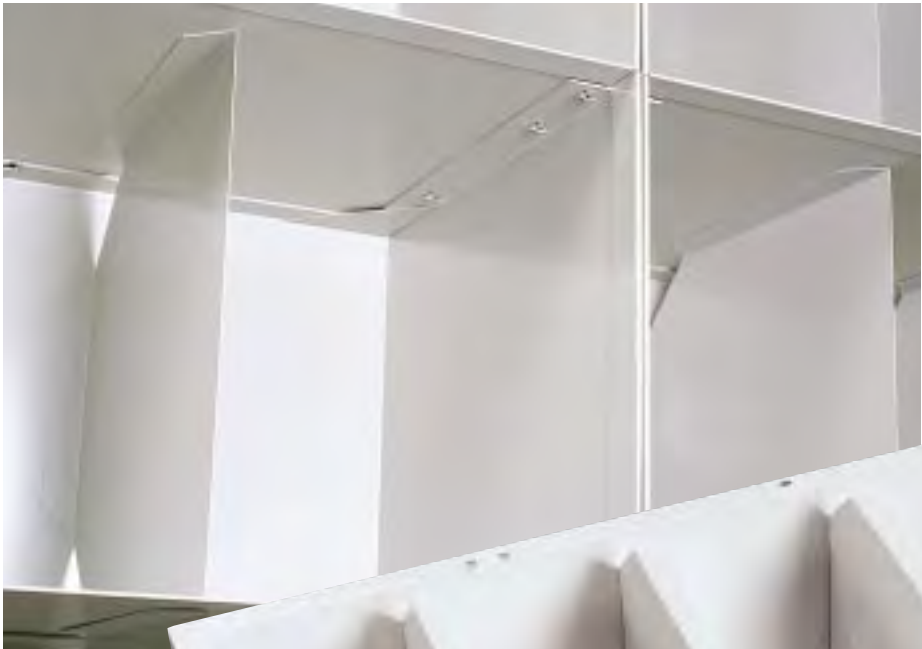
C-shaped file dividers.