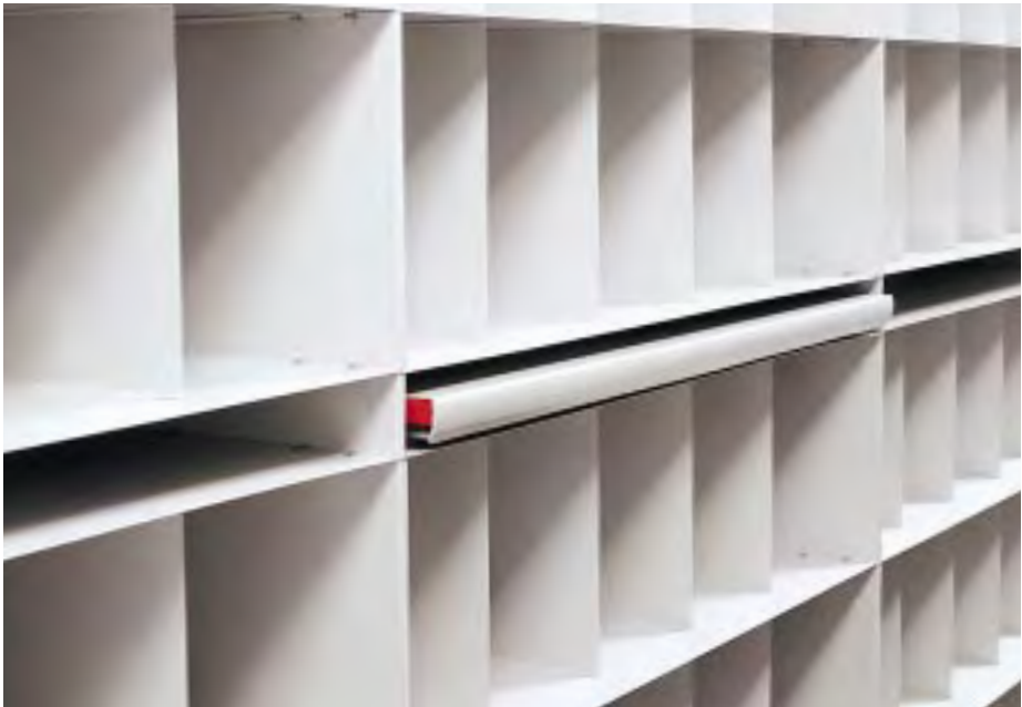
Dividers are welded into all JETER filing cabinets.