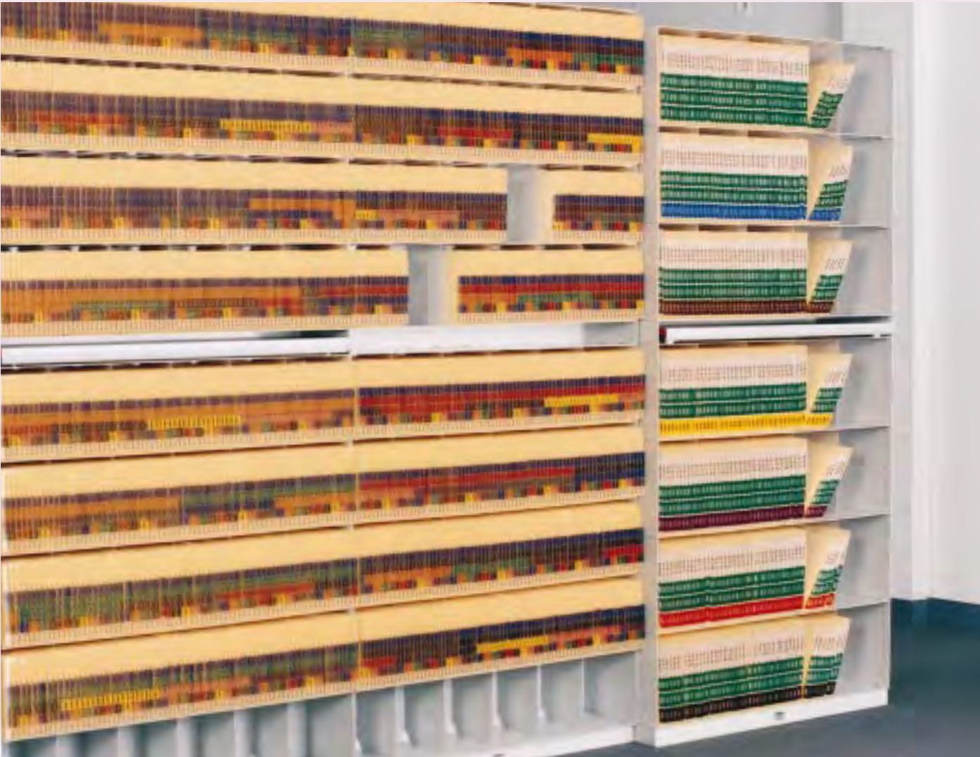
JETER Auto-Title SuperStax, 9-high (on left), are much more compact than traditional letter-size files (on right).

A new federal auto titling system is being adopted in many states across the United States. Automobile titles are now being created in a totally new size that is 8" H x 7" W. This new size is different from the previous titles issued, and JETER has developed a cabinet especially designed for this application. These cabinets are unique in depth, at slightly under 9", with an overall height profile of slightly over 8". This size enables nine Auto-Title shelves to stack up only slightly taller than seven letter-size Stax shelves – adding significant capacity gains.