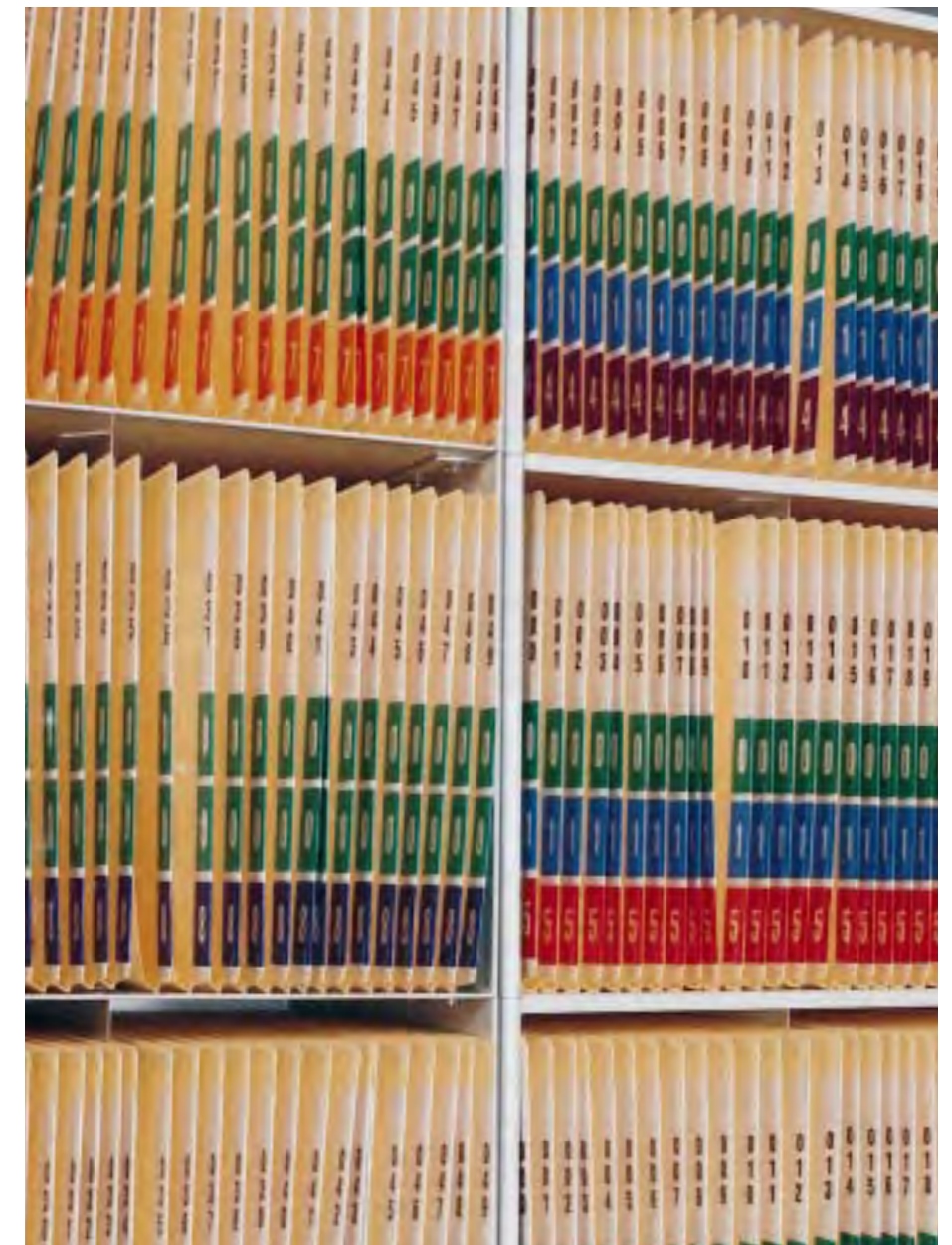
JETER's new SuperStax cabinet next to JETER Stax file. Both files have identical dimensions allowing the new design to be used in conjunction with Stax files.

SuperStax provides a clearance of 10\frac{1}{4} " for standard 9\frac{1}{2} " high end tab folders. Many systems only provide 9\frac{3}{4} " which is too close for fast filing.