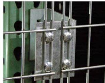
Offset brackets are available in different distances