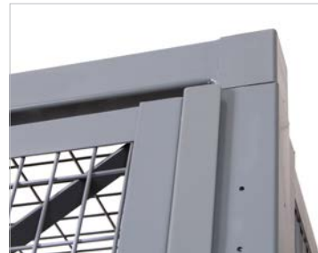
2" x 2" tubing provides strength and stability