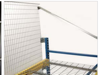
Adjustable extension kit allows you to extend panels past uprights