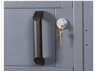
All LPCs come equipped with a cylinder lock