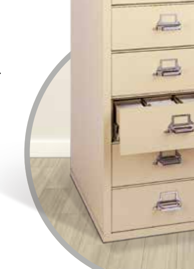
Shown in Parchment with 32026 Inserts (sold separately)