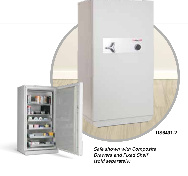
Made in t