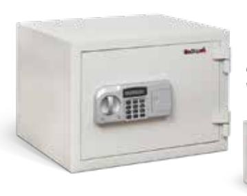
Comes standard with 1 tray.

Economical yet uncompromised fire protection! This heavy steel construction safe is equipped with an electronic lock for basic theft security, deterring burglary and shrinkage. These safes also carry a 1/2-hour, 1-hour or 1 1/2-hour rated fire label and are water resistant.