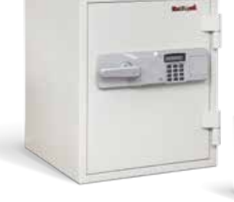
Comes standard with 1 shelf.