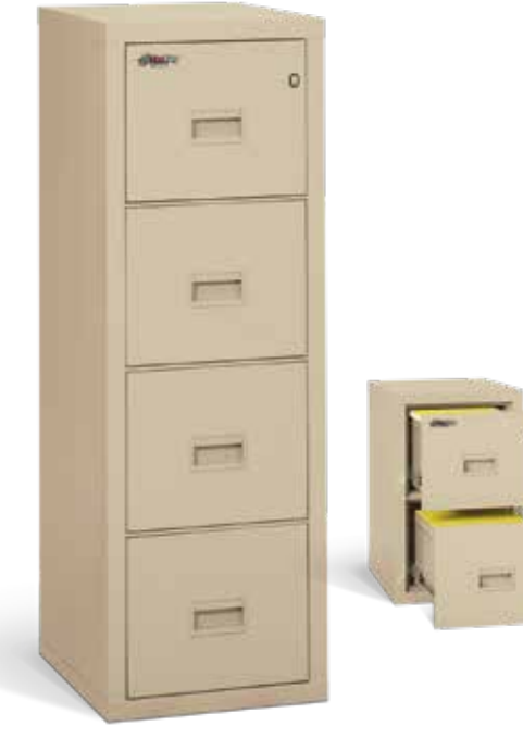
Made in the U.S.A.