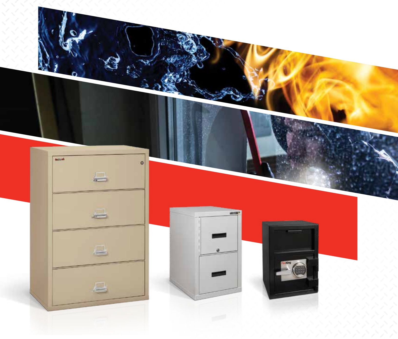
Protecting What's Important FOR OVER 65 YEARS