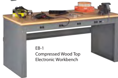
EB-1 Compressed Wood Top Electronic Workbench