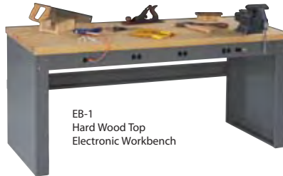
EB-1 Hard Wood Top Electronic Workbench