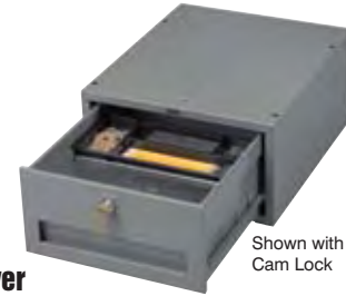
Shown with optional Cam Lock