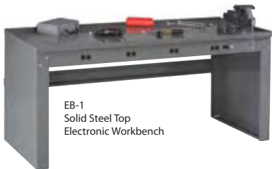
EB-1 Solid Steel Top Electronic Workbench