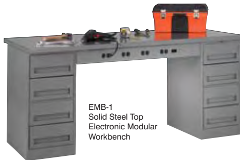
EMB-1 Solid Steel Top Electronic Modular Workbench

National Motor Freight classification: Class 70