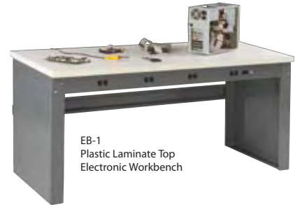
EB-1 Plastic Laminate Top Electronic Workbench