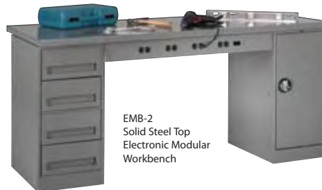
EMB-2 Solid Steel Top Electronic Modular Workbench