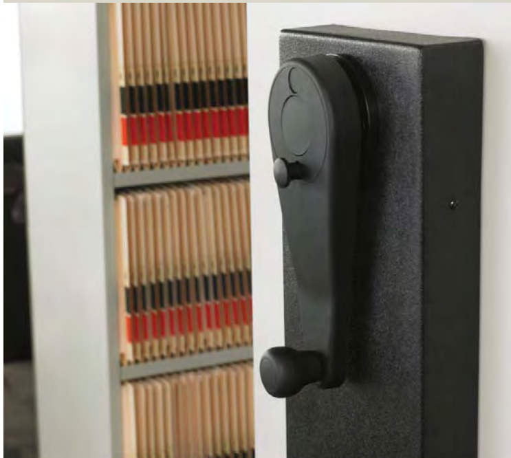
WAIST HIGH HANDLE INCLUDES RANGE LOCK. SECURITY HANDLE WITH KEY LOCK. (OPTIONAL)