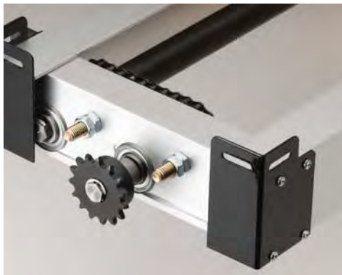
ALUMINUM CARRIAGES SUPPORT UP TO 1,000 LBS. PER LINEAR FOOT.