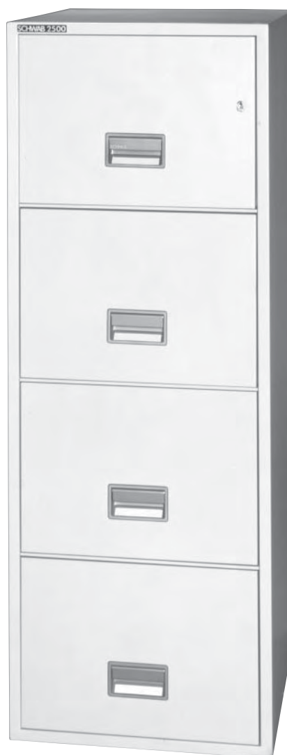
4CFC-2500: Four Drawer Vertical Legal size file. Outside Dimensions: 53 5 / 8 "H x 19 5 / 8 "W x 25"D Inside Drawer Dimensions: 10 1 / 4 "H x 15 1 / 8 "W x 20"D Approximate Shipping Weight: 513 lbs.

Schwab file is built to protect in the face of any disaster. Also available with a fire resistance rating only, Schwab is committed to offering you yet another choice that best suits your particular needs.