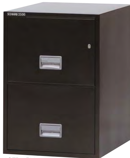
2CFD-2500: Two Drawer Vertical Legal Size File Outside Dimensions: 27 3 / 16 "H x 19 5 / 8 "W x 25"D Inside Drawer Dimensions: 10 1 / 4 "H x 15 1 / 8 "W x 20"D Approximate Shipping Weight: 210 lbs.