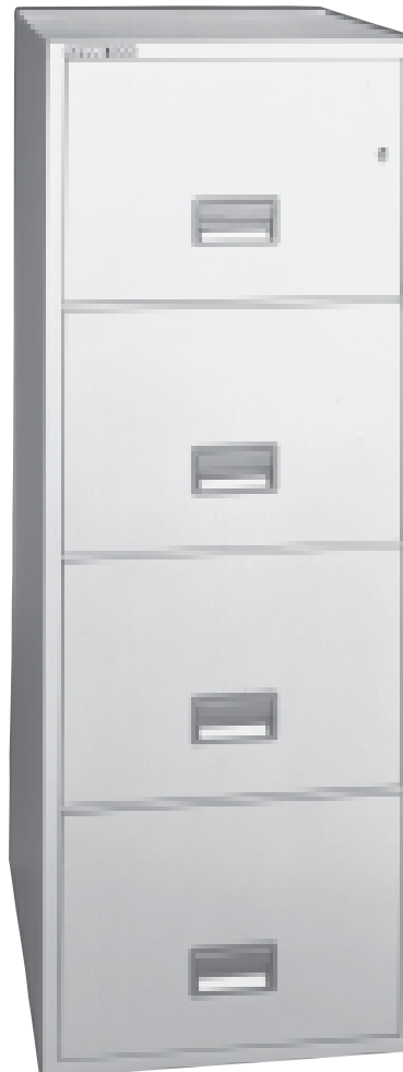
4LTC-5000: Four Drawer Vertical Letter size file. Outside Dimensions: 53 5 / 8 "H x 16 5 / 8 "W x 31"D Inside Drawer Dimensions: 10 1 / 4 "H x 12 1 / 8 "W x 26"D Approximate Shipping Weight: 620 lbs.

Our after-the-fire free replacement guarantee lets you know that once you have made the investment in a Schwab file, we will be there even if disaster strikes. We stand behind it, and have for over a century.