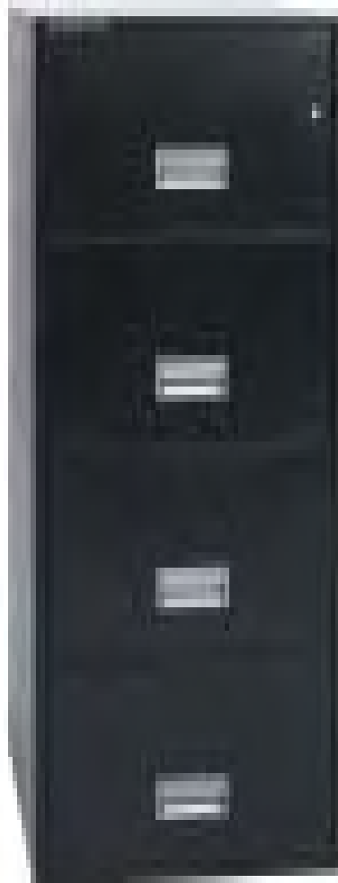
4LTC-2500: Four Drawer Vertical Letter Outside Dimensions: 53 9 / 16 "H x 16 5 / 8 "W x 25"D Inside Drawer Dimensions: 10 1 / 4 "H x 12 1 / 8 "W x 20"D Approximate Shipping Weight: 427 lbs.

All Schwab Trident® Series 2500 Vertical Fire and Impact Rated Files are UL rated to survive a fall of over 30 feet and still keep its contents safe from fire. Combined with the explosion hazard UL rating, these tests prove that the Schwab file is built to protect in the face of any disaster. Also available with a fire resistance rating only, Schwab is committed to offering you yet another choice that best suits your particular needs.