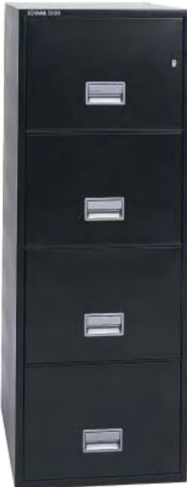
4CTC-5000: Four Drawer Vertical Legal Outside Dimensions: 53 5 / 8 "H x 19 5 / 8 "W x 31"D Inside Drawer Dimensions: 10 1 / 4 "H x 15 1 / 8 "W x 26"D Approximate Shipping Weight: 670 lbs.

Our after-the-fire free replacement guarantee lets you know that once you have made the investment in a Schwab file, we will be there even if disaster strikes. We stand behind it, and have for over a century.