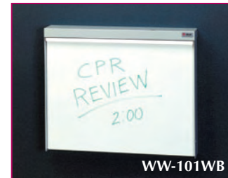
Painted White Board Finish