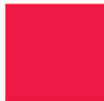
INDUSTRIAL RED T27