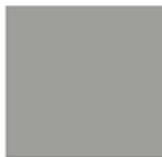
TEXTURED LIGHT GRAY T47