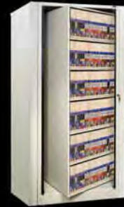
Ez2® Rotary Action File