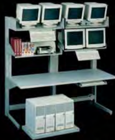
Technical Furniture Systems™