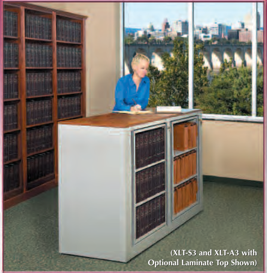
(XLT-S3 and XLT-A3 with Optional Laminate Top Shown)

The Ez2™ is a flexible and versatile storage solution. A three high unit can serve as a convenient work surface with storage underneath for common work areas. Multiple units can be joined together to double as storage and a room divider. The Ez2™ is perfect for any office application!