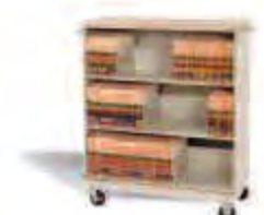
Specialty Filing & Storage