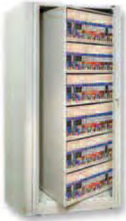
Ez2™ Rotary Action File

The Ez2™ offers up to 312%* more files per square foot than traditional filing systems!