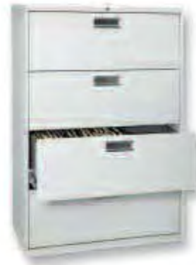
Lateral 4 Drawer