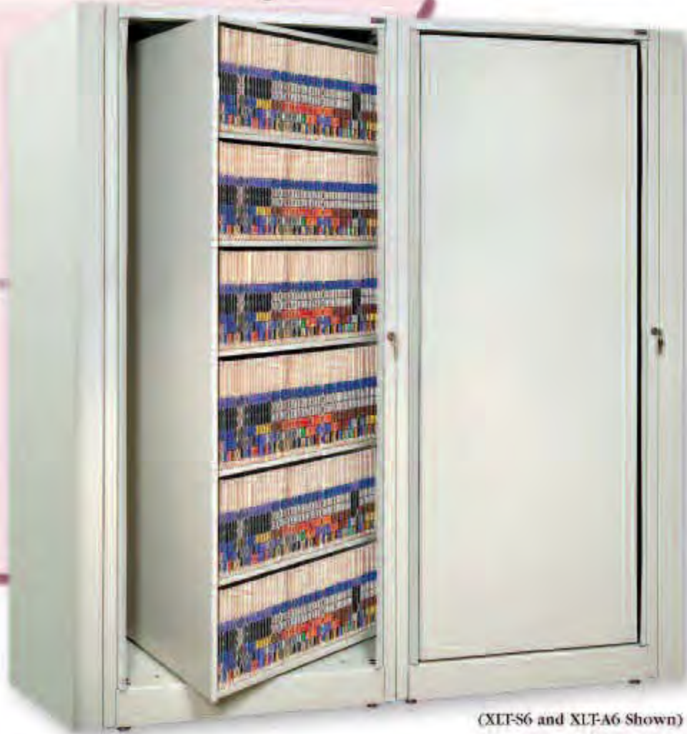
(XLT-S6 and XLT-A6 Shown)