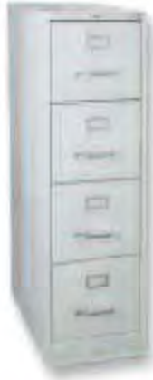
Vertical 4 Drawer