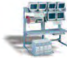
LAN & Security Systems