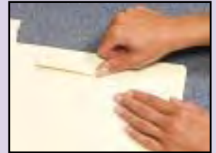
Fold on score lines to create reinforced panel.

ClickFile™ Software gives small offices and clinics the advantages of color coded shelf filing without the labor and cost of using labels. Plus, the ability to print on the entire folder gives you the opportunity to make your file folders more useful with printed forms, bar codes, and images.