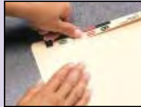
Fold on score lines to complete indexed tab.