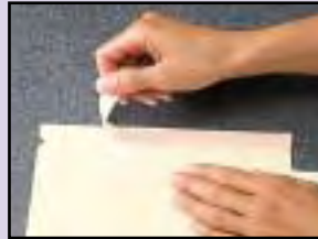
Peel off both tape backing strips.