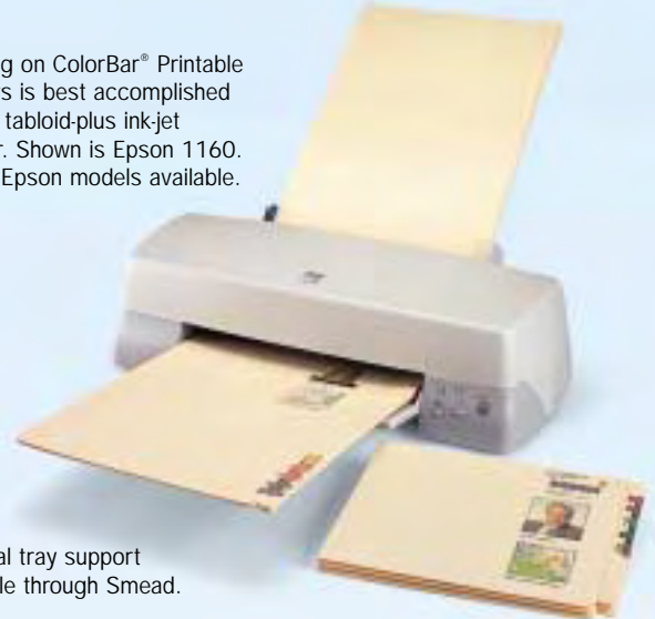
Optional tray support available through Smead.

Printing on ColorBar® Printable Folders is best accomplished with a tabloid-plus ink-jet printer. Shown is Epson 1160. Other Epson models available.