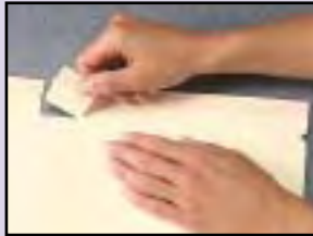
Remove and discard perforated excess.