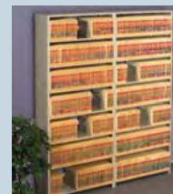
L&T 4 POST SHELVING