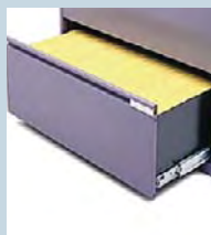
CONVENTIONAL 4-DRAWER FILE CABINETS