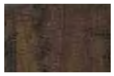
Chocolate Pear Tree