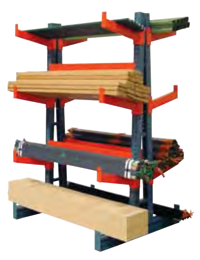
Double Sided Unit