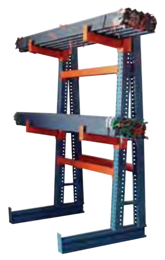
Single Sided Unit

Ideal for storing long products such as bars, pipes and rods. Available as either a single or double sided units. Two bases/columns, four brace beams and arms are required to make one free standing unit. All units are 79" tall. Arms are adjustable in 1½" increments. Choose either 12", 18" or 24" arms. Angled arms and welded end-stops provide secure/safe storage of long and/or irregular shaped merchandise. Connect multiple units to provide storage of extra long stock. Units assemble in less than 10 minutes.