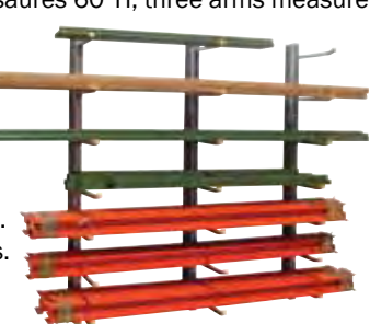
3 Sections Shown

15" with a 7½" clearance; four 12" arms that feature 9" clearances. Features an attractive zinc plated finish. Assembles in minutes. Sold in single sections. Minimum 2 sections needed.